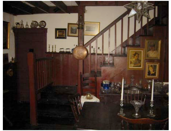
Peto's Studio, then and now. The setting that Peto created and knew, as well as many of the artifacts of his time, survives. These items are being stored-off site until construction is completed.